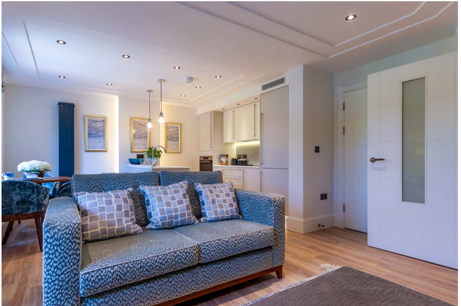
Apartments rented unfurnished. Moveable furniture not included. Rooms shown may not be representative of this apartment.